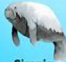
Sirenia (Manatees, Dugongs)