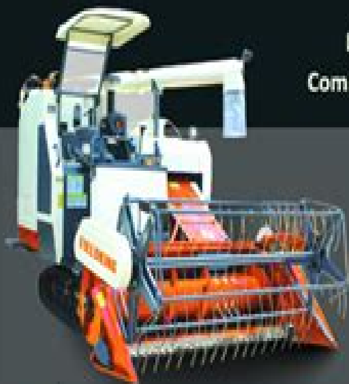
Multi Crop Combine Harvester