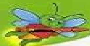
Illustration: © 1999 Scholastic Teaching Resources