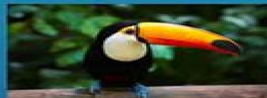
3. TOCO TOUCAN