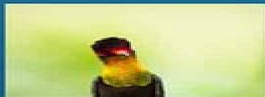
6. CRIMSON TOPAZ