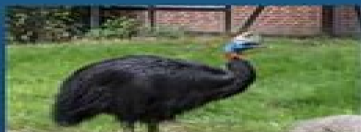
9. NORTHERN CASSOWARY