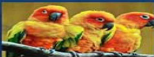
12. SUN PARAKEET