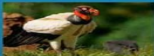
2. KING VULTURE