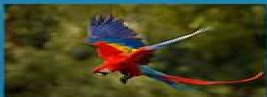
1. SCARLET MACAW