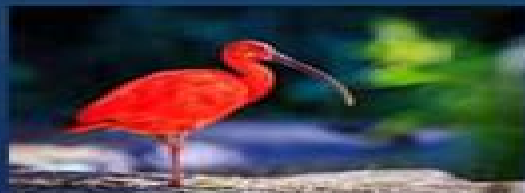
10. SCARLET IBIS