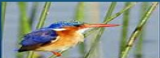
8. MALACHITE KINGFISHER