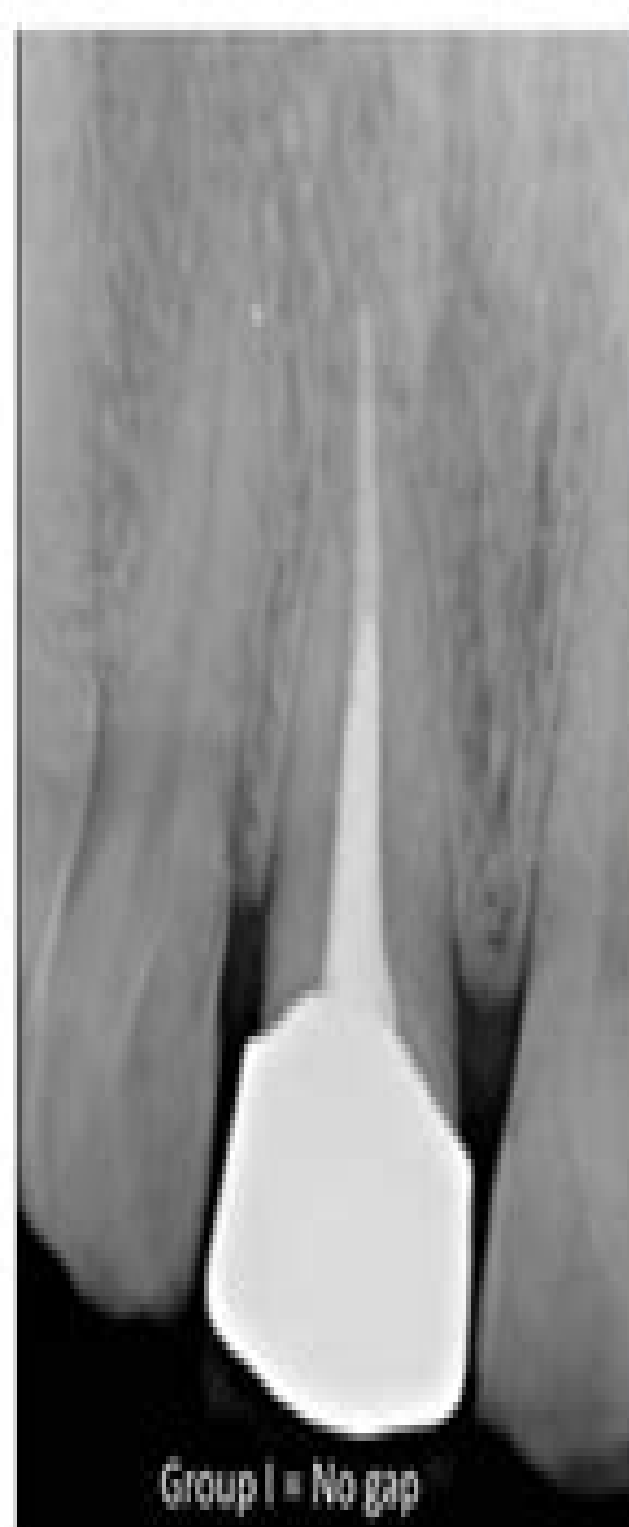
Group I = No gap