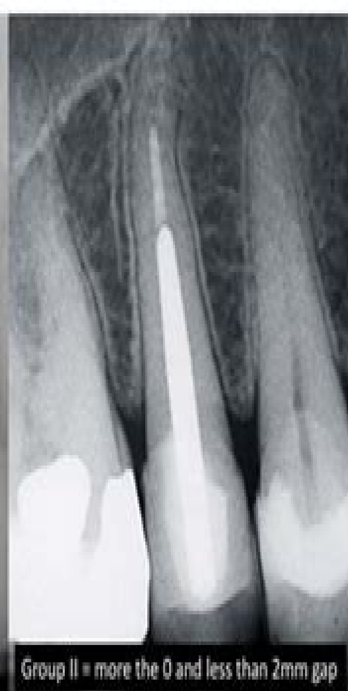
Group II = more the 0 and less than 2mm gap