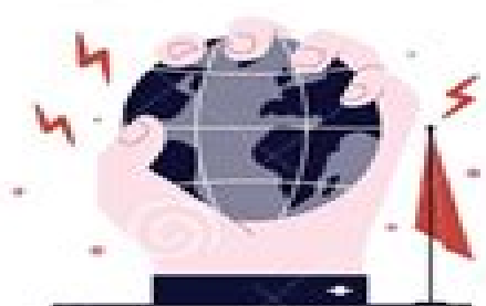
Tough Foreign Policy