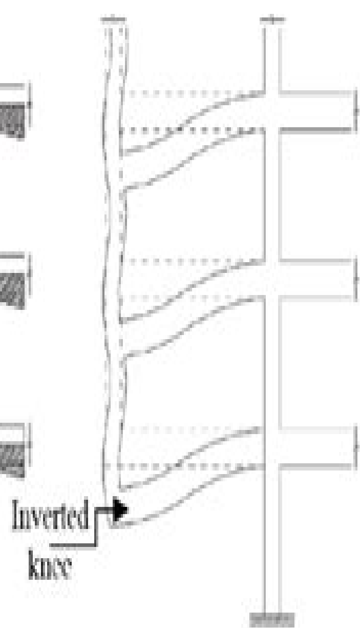
c) Deformed shape