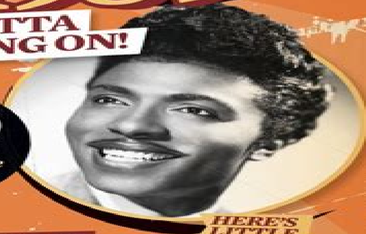
HERE'S LITTLE RICHARD Behind the scenes of a rock'n'roll classic

PLUS Carl Perkins ★ The Rock 'n Roll Trio ★ Billy Lee Riley ★ Cliff Richard ★ And more!