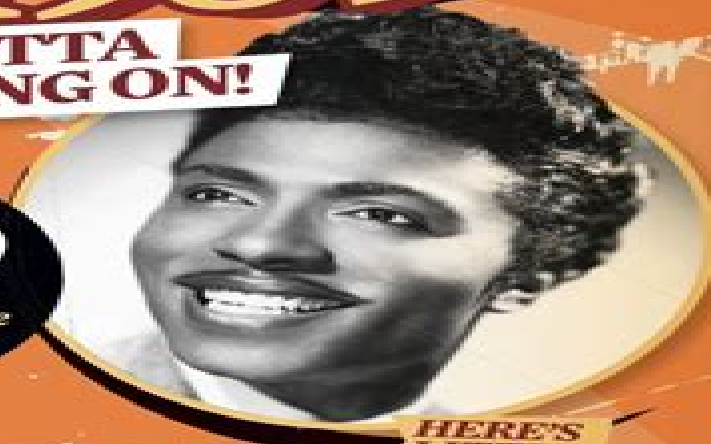
HERE'S LITTLE RICHARD Behind the scenes of a rock'n'roll classic

PLUS Carl Perkins ★ The Rock 'n Roll Trio ★ Billy Lee Riley ★ Cliff Richard ★ And more!