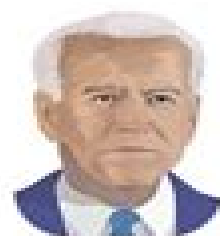
JOE BIDEN WINNER