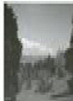
THE NATIONAL PARK SERVICE

THE NATIONAL PARK SERVICE LANDSCAPE ARCHITECTURE