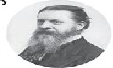
Charles Sanders Peirce (1839-1914)

Charles Sandes Peirce, was an American philosopher that also formulated a semiotic theory around the same time as Saussure, the early 1900's. Pierce stated semiotics to be the relationship between a SYMBOL, ICON and an INDEX.