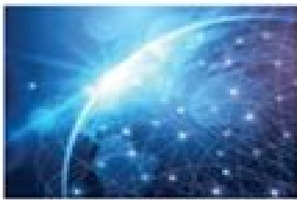
Information and Communication