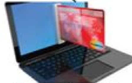
Computer Aided Design