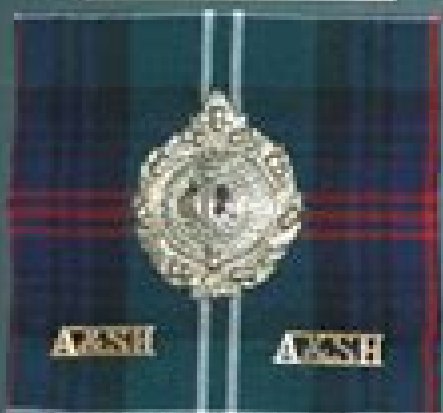
THE ARGYLL AND SUTHERLAND HIGHLANDERS (HIGHLAND REGIMENT)