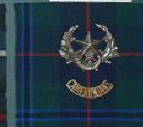
THE SEAFORTH HIGHLANDERS (HIGHLAND REGIMENT)