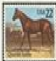
Quarter Horse — A1538

2184 A1537 22c gray green & pink red a Post marking (PM)