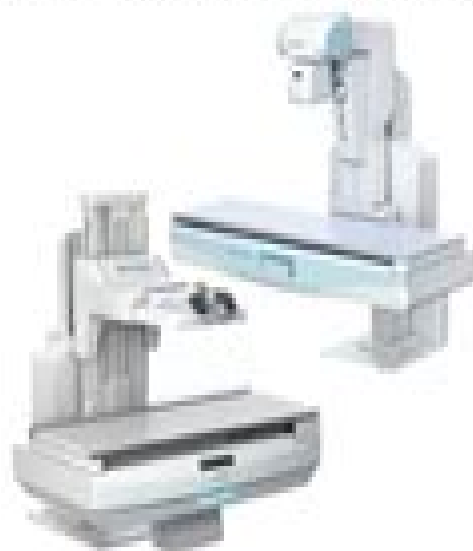
RADIOGRAPHY & FLUOROSCOPY