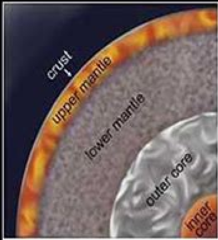
Earth's interior structure

Terrestrial planets have metallic cores (which may or may not be molten) & rocky mantles