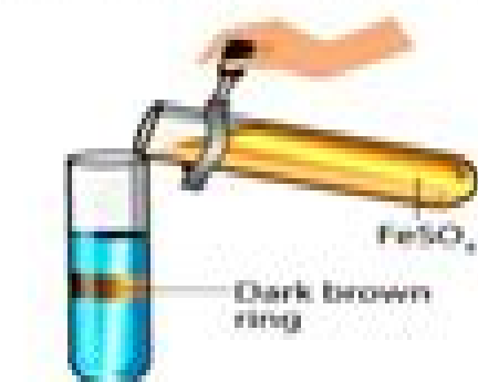
Brown ring test