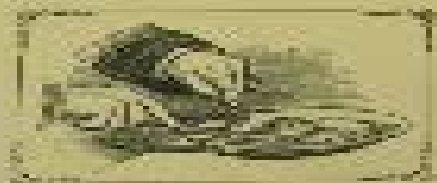
WRITING A LETTER