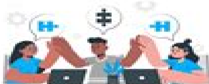
Positive Work Environment