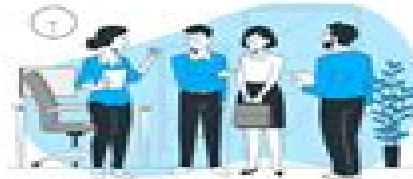
Employee Assistance Programs