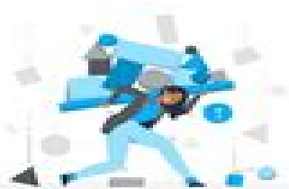
Reduce Workload and Work Pressure