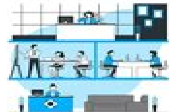
Physical Workplace Conditions