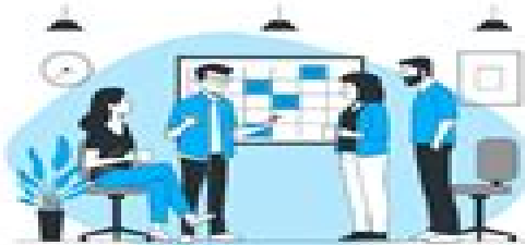
Stress Management Training