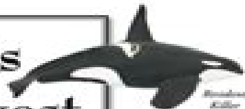
Resident Killer Whale