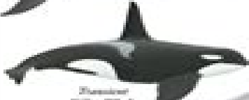
Transient Killer Whale