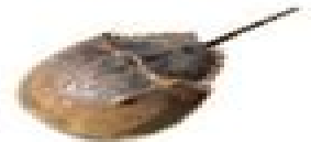
Atlantic Horseshoe Crab