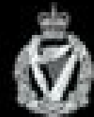
Royal Irish Regiment