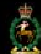
Royal Army Veterinary Corps