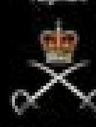
Royal Army Physical Training Corps