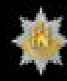
Royal Anglian Regiment