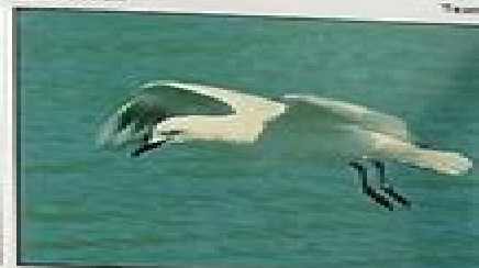
(390) Black-billed Gull Larus bulleri