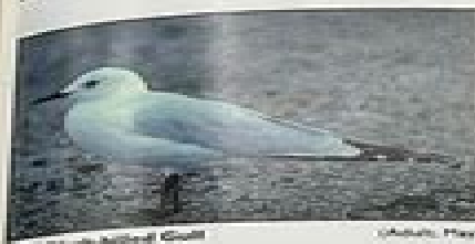
(387) Black-billed Gull Larus bulleri