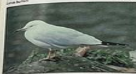
(389) Black-billed Gull Larus bulleri