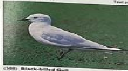
(388) Black-billed Gull Larus bulleri