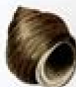
Common Periwinkle (B,Y)

Littorina maritima To 1 in. (2 cm) high Grayish-white, sculpted shell has low spiral ridges. Common in marshes and estuaries.