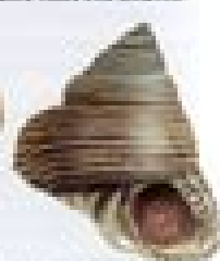
Ribbed Top Shell (W)

Hydrobia ulitiformis To 1 in. (2 cm) high Cone-shaped shell is black, to brownish-gray. Feeds on biofilms.