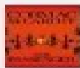
November release Penguin