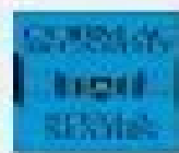
December release Penguin