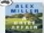
November release Allen & Unwin