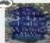
October release 4th Estate