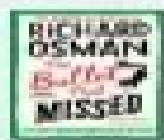
Late September release Viking Australia