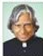
Dr. A.P.J. Abdul Kalam Former President of India