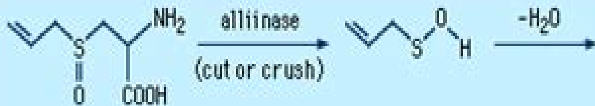
S-2-propenylcysteine S-oxide, in garlic