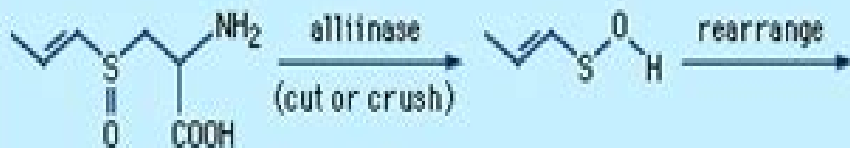
S-1-propenylcysteine S-oxide, in onion