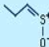
propanethial S-oxide (onion lacrimatory factor)