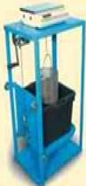
Sp. Gr. & Water Absorption Test