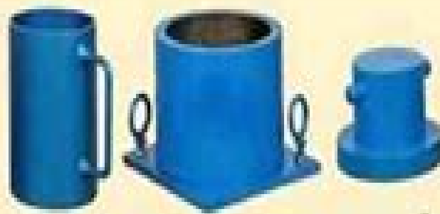
Crushing Value Test