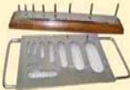
Flakiness & Elongation Test