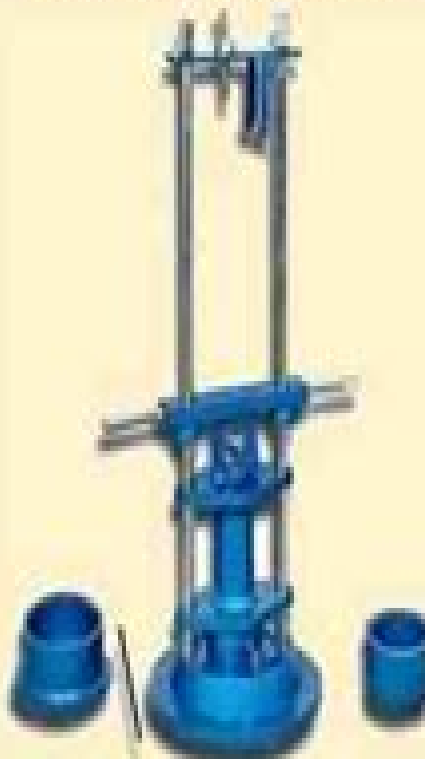
Impact Value Test