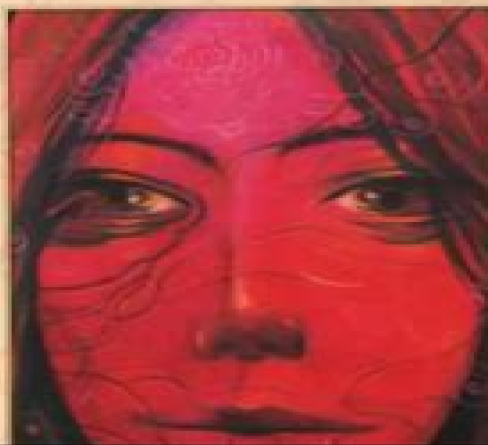
THE REAL YOU