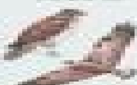
Sharp-shinned Hawk Broad-winged Hawk