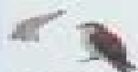
Broad-winged Hawk Sharp-shinned Hawk