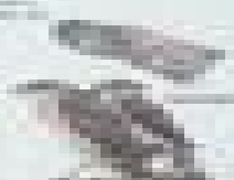
Sharp-shinned Hawk Broad-winged Hawk