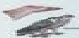
Sharp-shinned Hawk Broad-winged Hawk