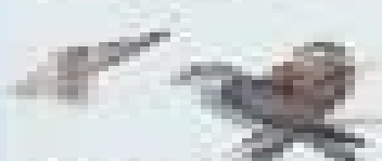
Broad-winged Hawk Sharp-shinned Hawk