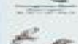
Broad-winged Hawk Sharp-shinned Hawk