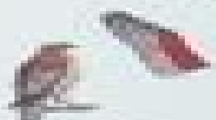
Sharp-shinned Hawk Broad-winged Hawk