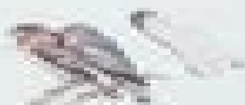
Broad-winged Hawk Sharp-shinned Hawk