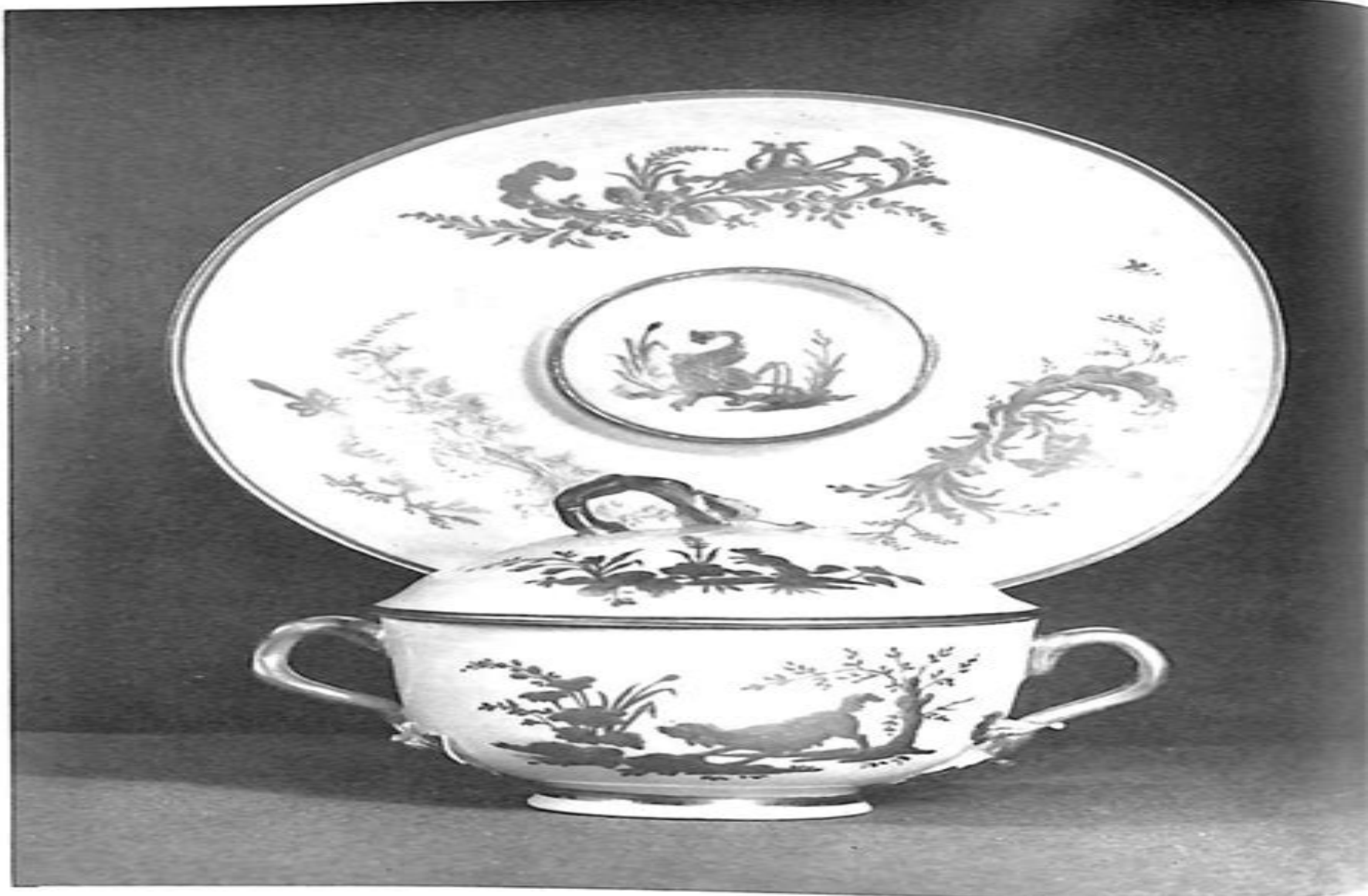
Plate 40. Covered cup and saucer decorated with relief gilding on white porcelain. Vincennes. c. 1750. (Fitzwilliam.)