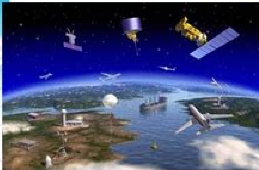
Global Observing System