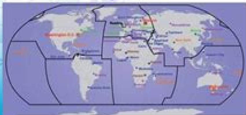
Global Data Processing and Forecasting