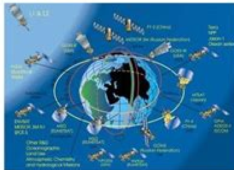
Coordinated Satellite Activities