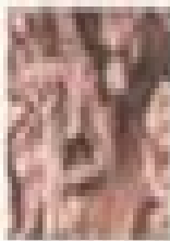
and the man in The Wind of Oil?