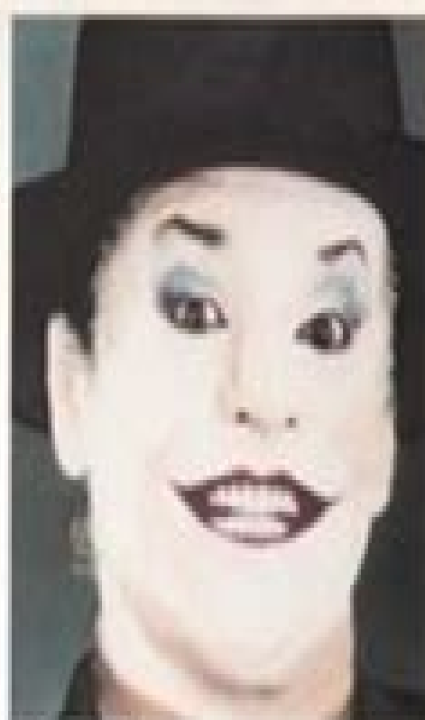
and the Joker?