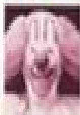
and from the Chair?