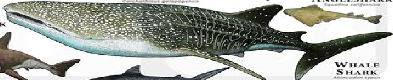
WHALE SHARK Phalarodon tylosis