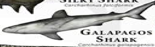
GALAPAGOS SHARK Carcharhinus galapagensis