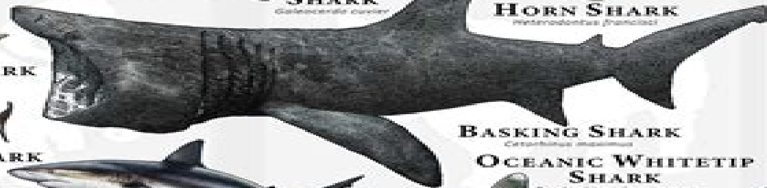
BASKING SHARK Cetorhinus maximus