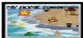
Figure 40a-d—Kindergarten projects

_____ You will complete many projects this year that require pre-keyboarding (Figures 40a-d):