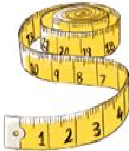
Measuring tape (inches)