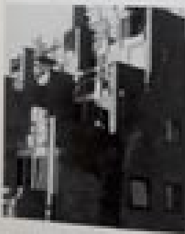
Fig. 12. Showing the various balconies and staircases. The first floor has been a private balcony. Fig. 14. The structure of the building is a steel frame with concrete slabs. The balconies are made of steel and concrete. The structure is a steel frame with concrete slabs. The balconies are made of steel and concrete.