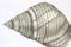
Marsh Periwinkle (CB,V)

Olivella septentrionalis To 2.5 in. (6 cm) Glossy, yellow to grayish cylindrical shell has markings that resemble lettering. South Carolina's state shell.