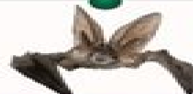
Kitti's Hog-Nosed Bat