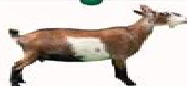
Nigerian Dwarf Goat