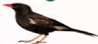
Red-billed Buffalo Weaver