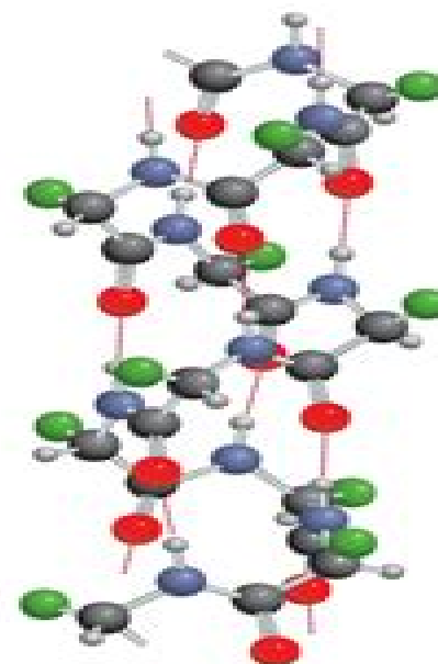
Figure 16.21 The \alpha -helical structure of a polypeptide chain. The structure is held in position by intramolecular hydrogen bonds, shown as dotted lines. For color key, see Figure 16.19.