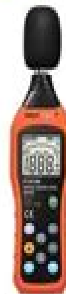
Sound Level Meter