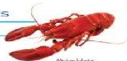
Illustration by Scholastic