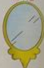
es pe jo