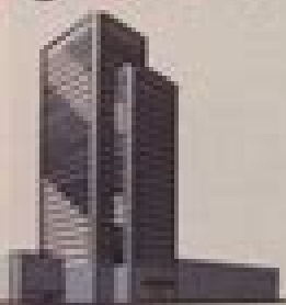
e di fi cio