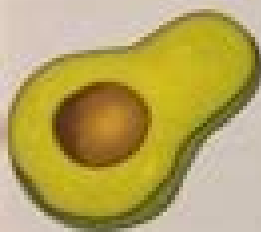
gua ca te