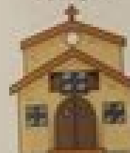
i gle sia