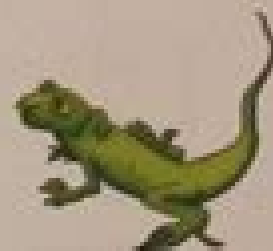
i gua na