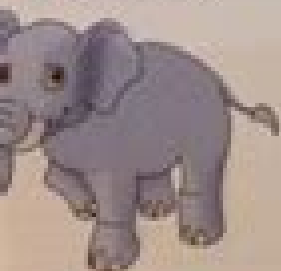
e le fan te