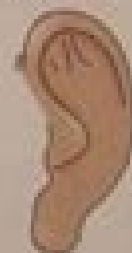
o re ja