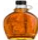
real maple syrup