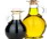
olive oil & vinegar