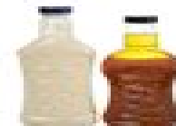
dressing with toxic oil