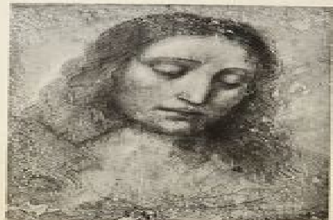
L. F. Dutton, 1824

It differs from sculpture and painting diametrically: language comes to us considerably like them. Speech, like music, is a string of sounds. Writing is a string of signs. It is easier to imagine sounds in a sequence, than the page of a book. Let us get this disentangled from what is accidental. It is our custom to write from left to right along lines. Writing and printed matter look natural because we are accustomed to them. Other alphabets strike us as instantly more difficult, until we grow accustomed to them. Then direct we all are we for even from the specimens of writing on the following page. If the page is held up to the light, and looked through, or so