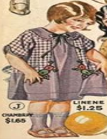
(J) CHAMBRAY $1.65