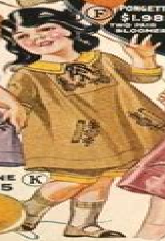
(F) FORGETTE $1.98 TWO PAIR SLICKERS