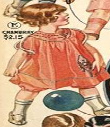
(E) CHAMBRAY $2.15