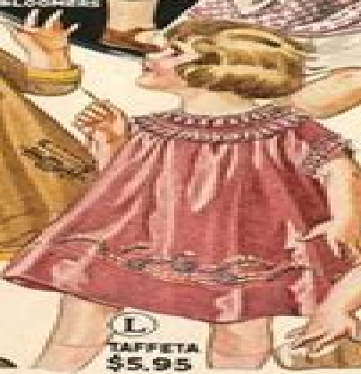
(L) TAFETA $5.95