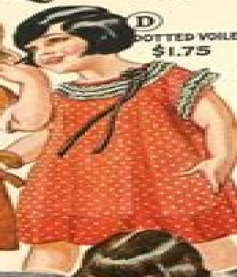
(D) DOTTED VOILE $1.75