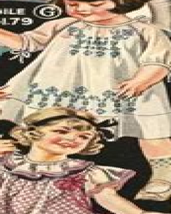
(G) VOILE $1.79