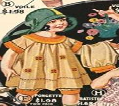
(B) VOILE $1.98