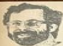
VisiCalc DAN BRICKLIN