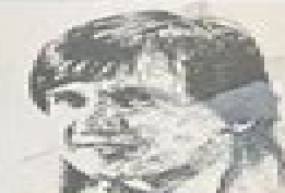
Microsoft Bravo CHARLES SIMONYI