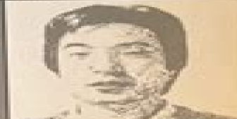
Pac Man TORU IWATANI