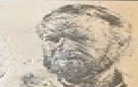
PostScript JOHN WARNOCK