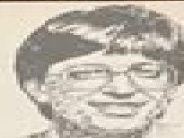
Basic BILL GATES