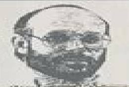
Lotus 1-2-3 JONATHAN SACHS