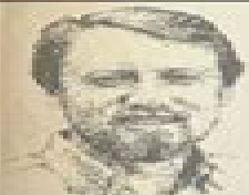
CP/M GARY KILDALL