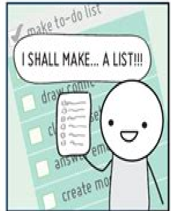
The List Maker