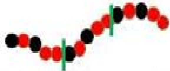
Sequential Copolymer (4)