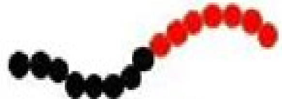
Block Copolymer (2)